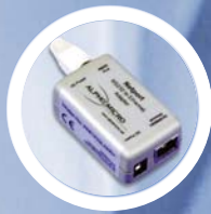
PLUG AND PLAY