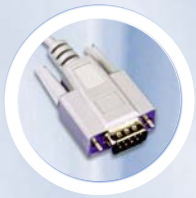
SERIAL TO ETHERNET